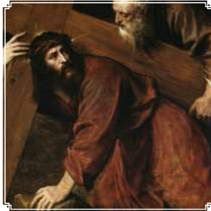
Christ Carrying the Cross (1560) Titian

(Because by Thy Holy Cross, Thou hast redeemed the world.)