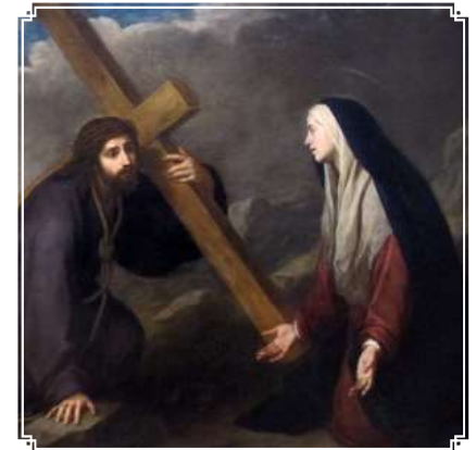
Christ Meets the Virgin Mary on the Way to Calvary (1665-75) Bartolomé Esteban Murillo

(Because by Thy Holy Cross, Thou hast redeemed the world.)