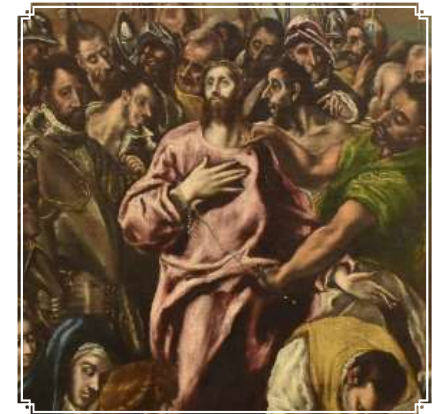
Jesus Christ Stripped of His Garments (1600) El Greco

(Because by Thy Holy Cross, Thou hast redeemed the world.)