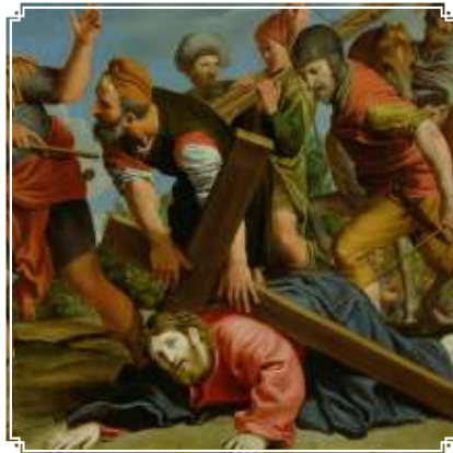
The Way to Calvary (1610) Domenichino (Domenico Zampieri)

(Because by Thy Holy Cross, Thou hast redeemed the world.)