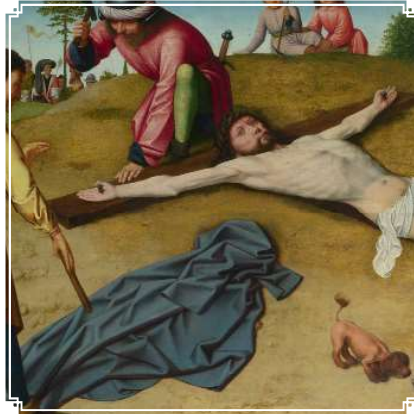
Christ Nailed to the Cross (1491) Gerard David

(Because by Thy Holy Cross, Thou hast redeemed the world.)