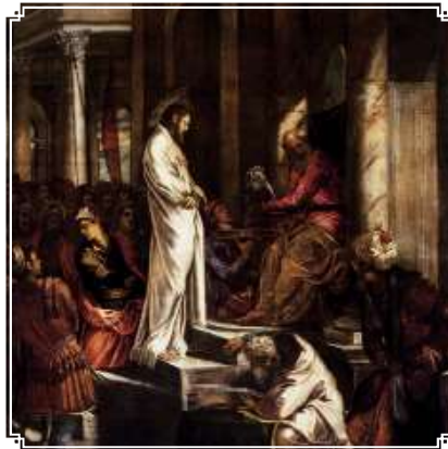
Christ before Pilate (1566-1567) Jacopo Tintoretto

(Because by Thy Holy Cross, Thou hast redeemed the world.)