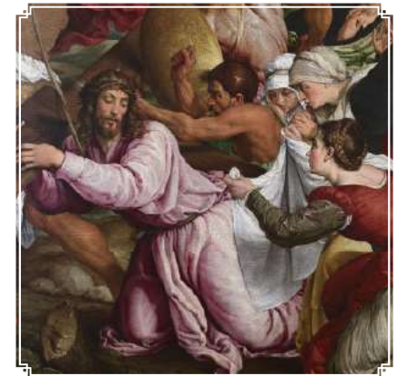
The Way to Calvary (1540) Jacopo Bassano

(Because by Thy Holy Cross, Thou hast redeemed the world.)