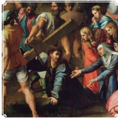
Christ Falling on the Way to Calvary (1516) Raphael

(Because by Thy Holy Cross, Thou hast redeemed the world.)