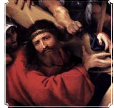
Christ Carrying the Cross (1526) Lorenzo Lotto

(Because by Thy Holy Cross, Thou hast redeemed the world.)