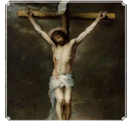
The Crucifixion (1675) Bartolomé Esteban Murillo

(Because by Thy Holy Cross, Thou hast redeemed the world.)