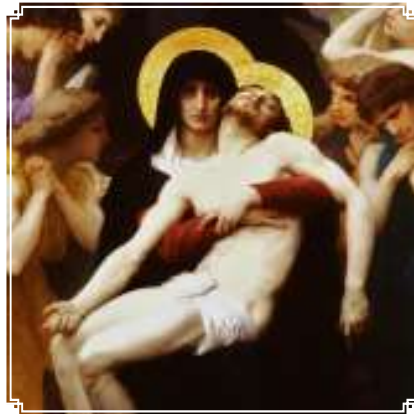
Pieta (1876) William-Adolphe Bouguereau

(Because by Thy Holy Cross, Thou hast redeemed the world.)