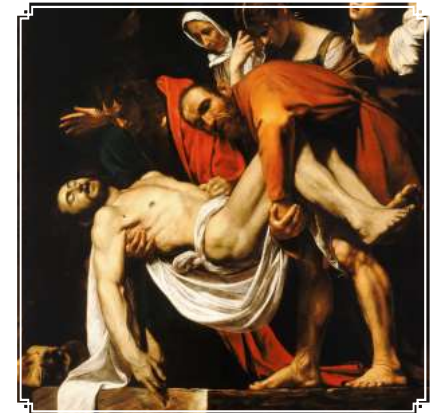
The Deposition of Christ (1602-1603) Caravaggio

(Because by Thy Holy Cross, Thou hast redeemed the world.)