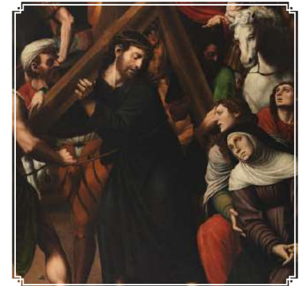
Christ on the Route to Calvary (1536-1538) Juan de Juanes, Vicente Juan Masip

(Because by Thy Holy Cross, Thou hast redeemed the world.)