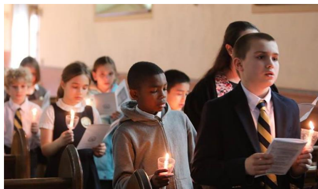
"I believe the Eucharist is the body and blood of Christ"