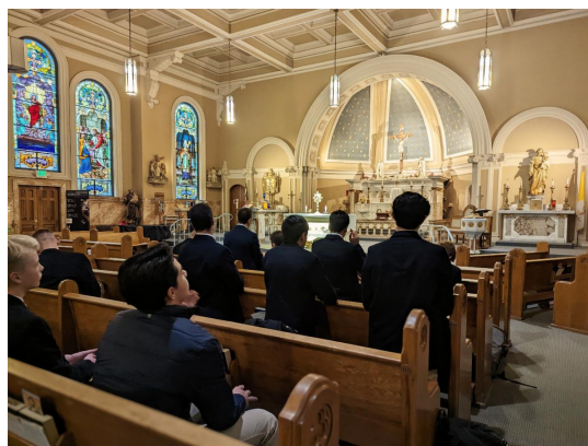
The first photo (left) is from the Eucharistic Miracles lecture, the photo of the students in Adoration (right) is from a First Friday devotion, and lastly the image of students kneeling before the statue of Christ was from a recent fundraiser (top).